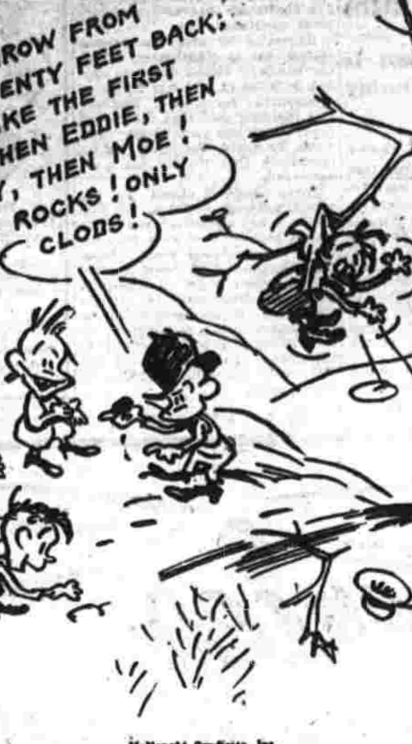
BY FOUNTAINE FOX